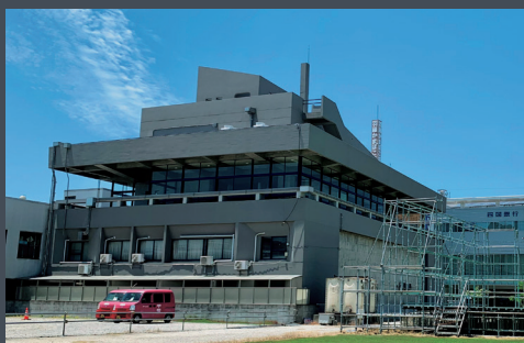
Ehime Shinkin Bank, Imabari Branch