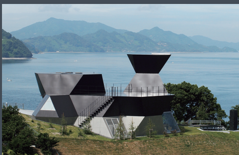
Toyo Ito Museum of Architecture